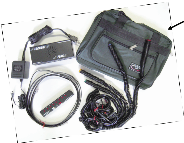
Lockout Plus system package with Handheld buttons

Choose either handheld or table top buttons with built in LED indicators