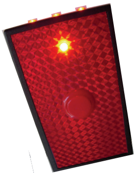
Table Top Lockout Buttons With built-in LED's (4 supplied, controls up to 8)

Manufactured by Creative IMAGINEERING the Game Show Mania ® people (800) 644-3141 (954) 316-6001 www.gameshowmania.com