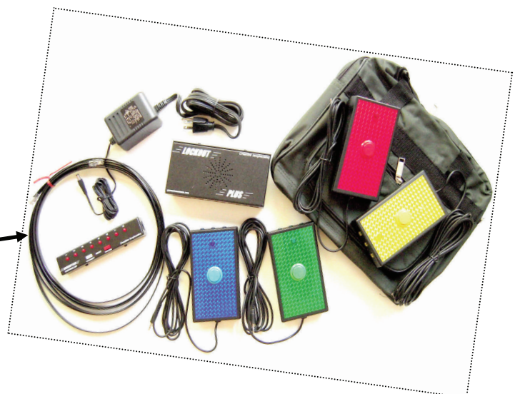
Lockout Plus system package including Table Top buttons with LED's